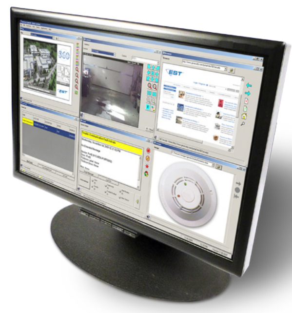
Your compass: EST3's FireWorks Graphical Command Interface.

This means, for example, that during an emergency your system operator can broadcast audio instructions, view live CCTV, and disarm security partitions in order to provide occupants with unencumbered egress – all without taking his or her eyes off the system display. Only Synergy-enabled EST3 with mass notification merges emergency communications with threat detection – and security control – to offer this level of crisis management.